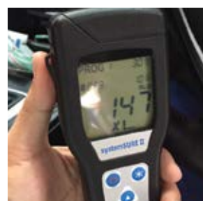
40 mins after spraying Bactashield